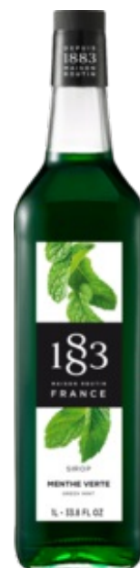
GREEN MINT 1883