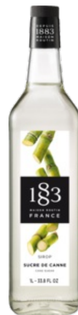
CANE SUGAR 1883