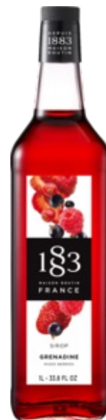
MIXED BERRIES 1883